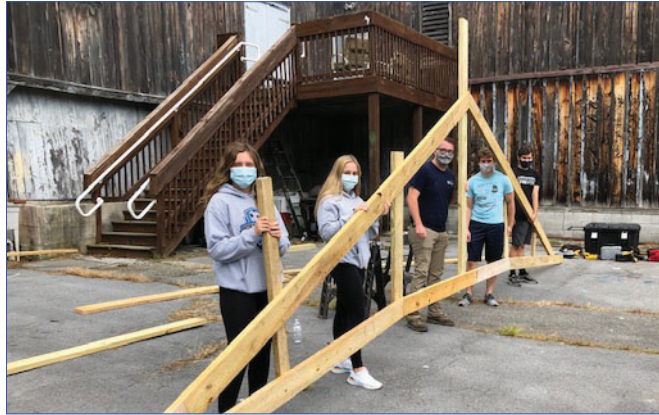
Volunteers holding first bridge section made