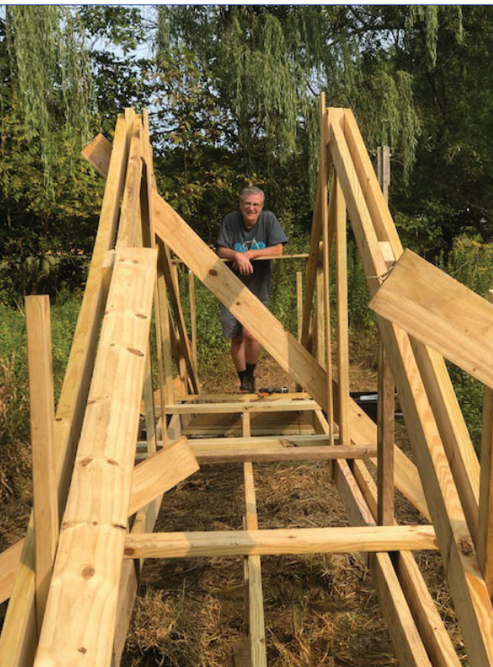
Above, bridge building's hard work, but worth a smile!