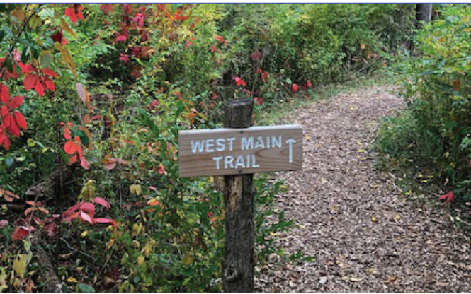
West Main Trail head, ending at the bridge